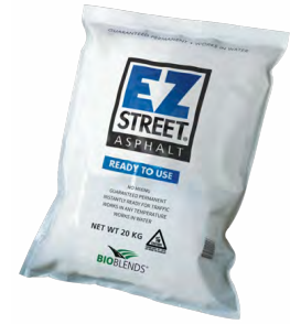
VALUE BAG - 20 kg

Don't be left short on the job. Try the 20 kg value bag.