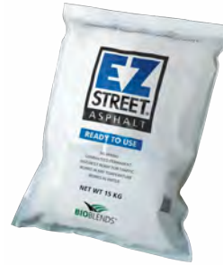
EZ LIFT BAG - 15 kg

The perfect quick grab solution. Stores up to 12 months.