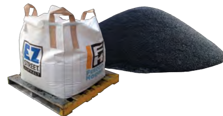
1 TONNE BULK BAG * or LOOSE BULK

Minimise your costs by purchasing EZ Street in either one tonne bulk bags or in loose bulk. Realise significant cost savings in your maintenance budget, when you buy in bulk.