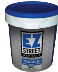
TOUGH 20 kg bucket

Tough, resealable, easy to handle, easy to stack.